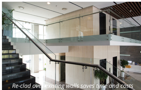
Re-clad over existing walls saves time and costs