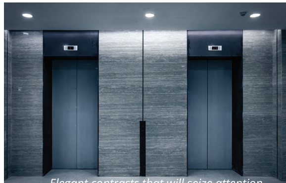
Elegant contrasts that will seize attention